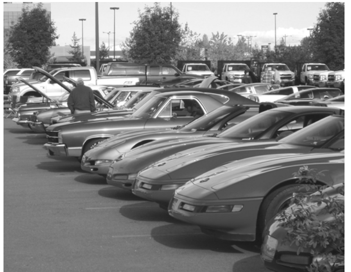
Just some of the cars on display at the End of Season Corvette Party.