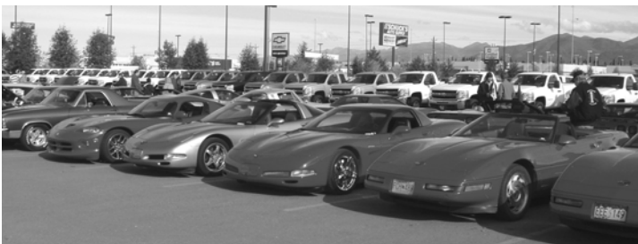
A Viper could get lost in all those Corvettes.